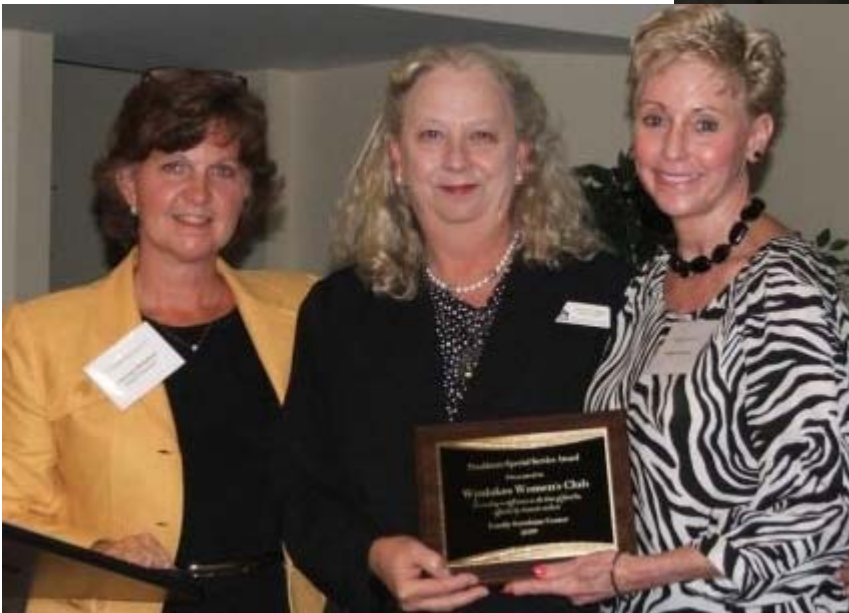
ABOVE: The STEP Foundation receives a Special Presidents Award.