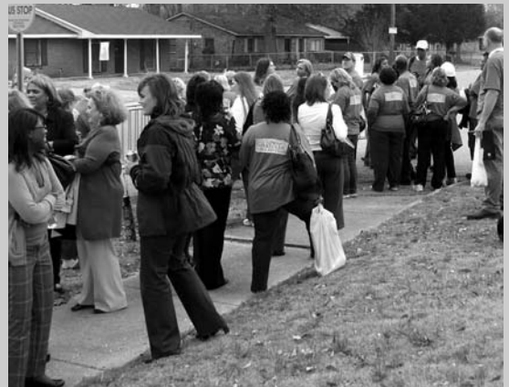
FSC staff and others wait to begin filming.